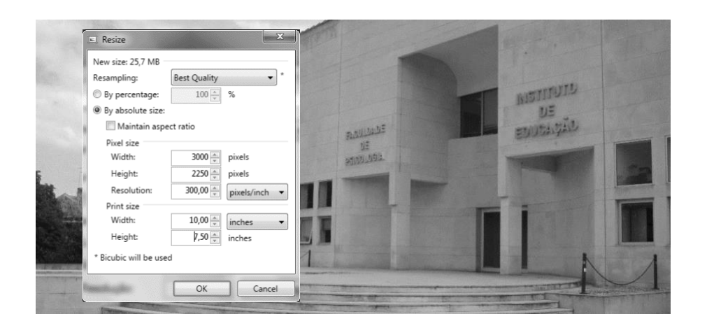
Figure [number]. Caption.

Figures must be centred. Place the figure number and its caption below. The caption must be a concise descriptive explanation and must include the source. If there is a legend, it must be in the same language as the article and it should be part of the figure. An example: